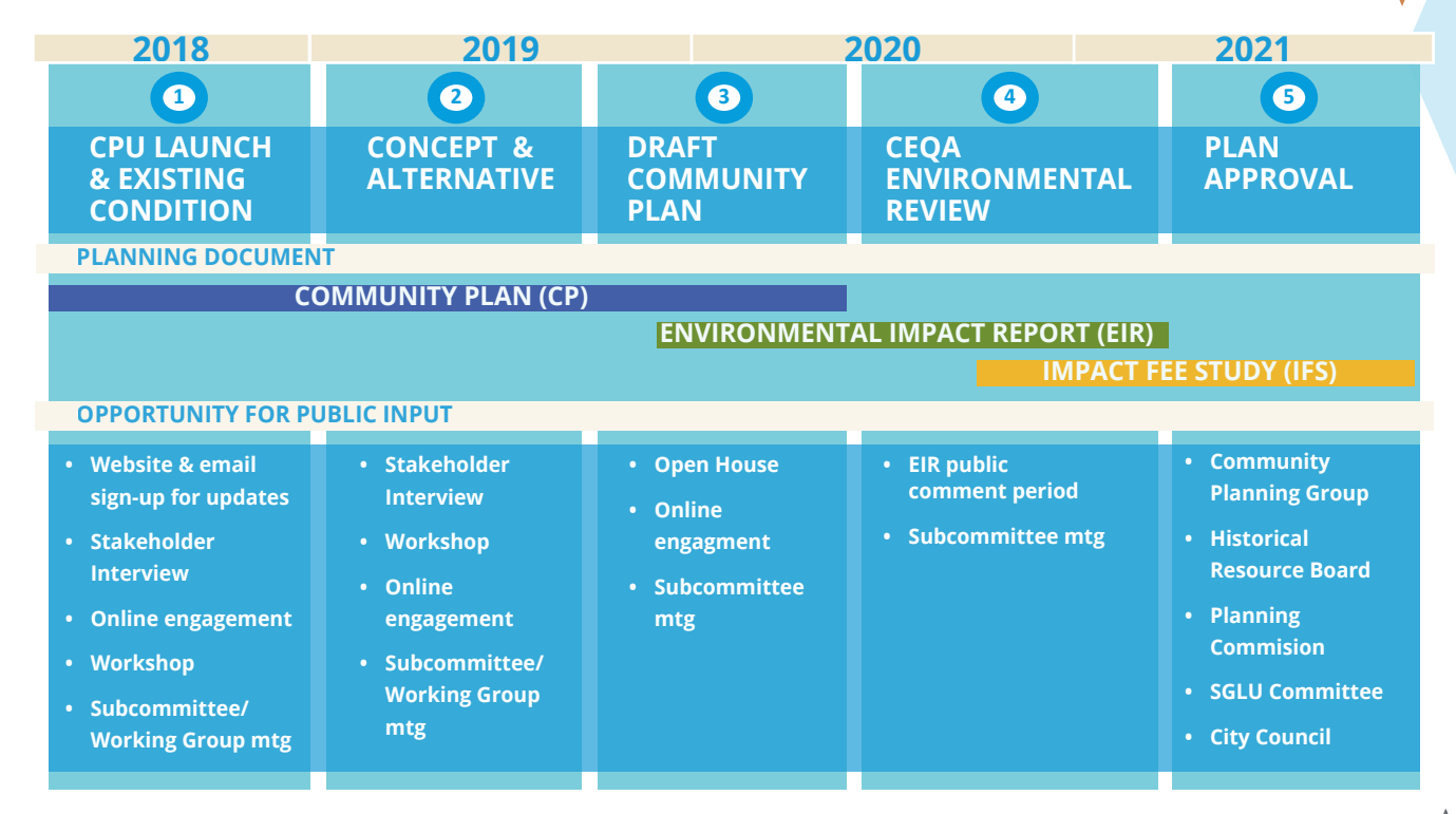
FIGURE 1 - MIRA MESA CPU PROCESS AND TIMELINE

The City of San Diego is inviting participation in the update to the Mira Mesa Community Plan, which will serve as the "blue print" for the community's future growth and development. Community plans set policies and proposals on a wide array of topics including: housing, mobility, open space and parks, public facilities, sustainable development, urban design and historic preservation.